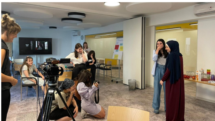
WIR III Workshop participants.

14 girls and young women in Vienna and 6 girls and young women in Graz took part in vivid discussions on the topics of identity, belonging, home and experiences of discrimination, as well as expectations towards (migrant) women. To enhance their opportunities for voicing their thoughts and concerns, participants were enabled to use their creativity to prepare one short film per workshop group. For this, they experimented with camera work, sound recording and the development of storyboards with the support of media experts. Even anime elements can be expected in this year's short films! The participants' active involvement throughout the workshops demonstrates the valuable approach of the project while addressing important questions on social inclusion and integration. In September 2021, the workshop groups will meet again to discuss the finalization of their media products and in November 2021, the girls and young women will have the opportunity to present