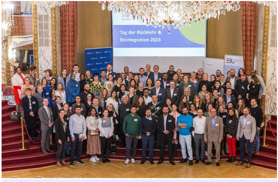
Group picture with return counsellors from the BBU on the first day.

Further information on IOM Austria's AVRR activities can be found on our website and in the upcoming AVRR newsletter.