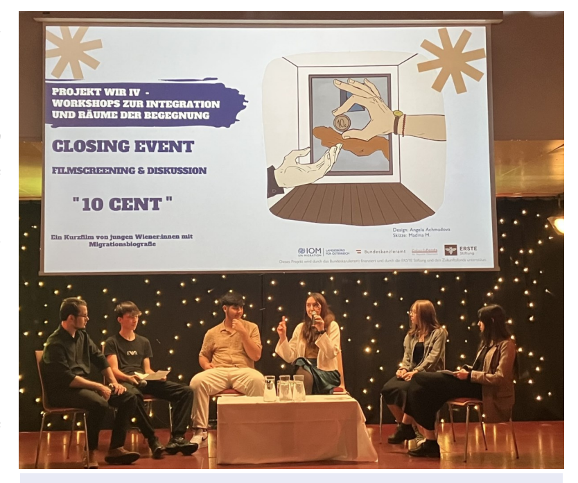
Young participants present their short films at the closing event.

You can find out more about the WIR project on our website and on Instagram.