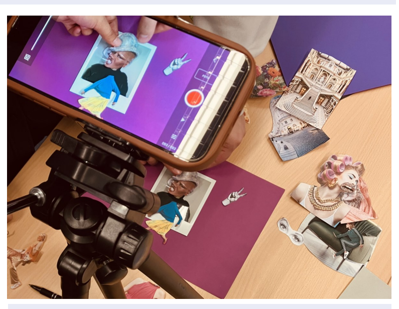
Workshop participants at bfi creating a Stop Motion Clip.

You can find out more about the WIR project on our website and on Instagram.