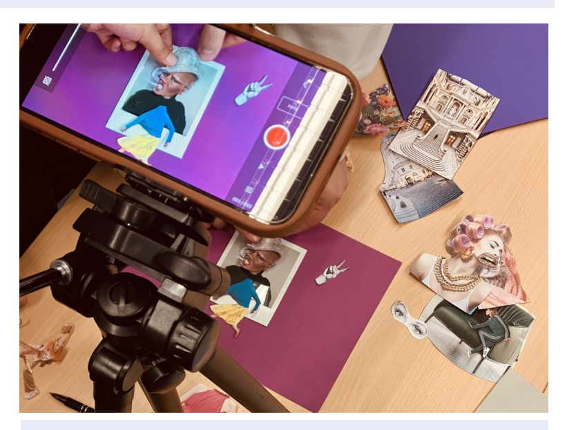
Workshop participants at bfi creating a Stop Motion Clip.

You can find out more about the WIR project on our website and on Instagram.