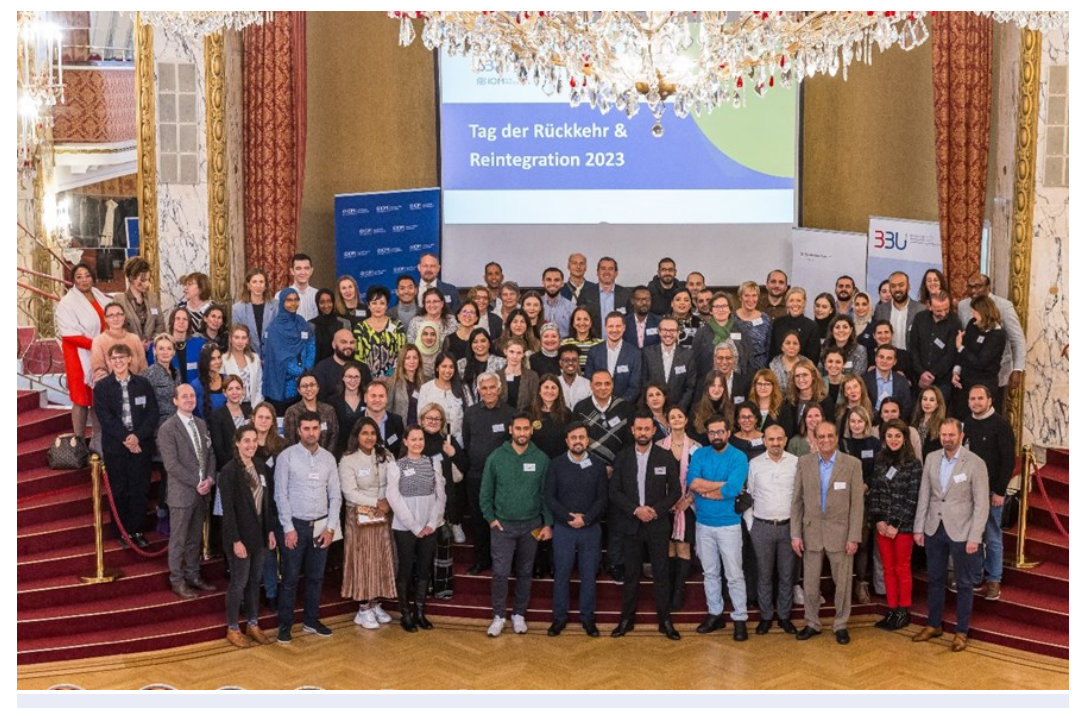
Group picture with return counsellors from the BBU on the first day.

Further information on IOM Austria's AVRR activities can be found on our website and in the upcoming AVRR newsletter.