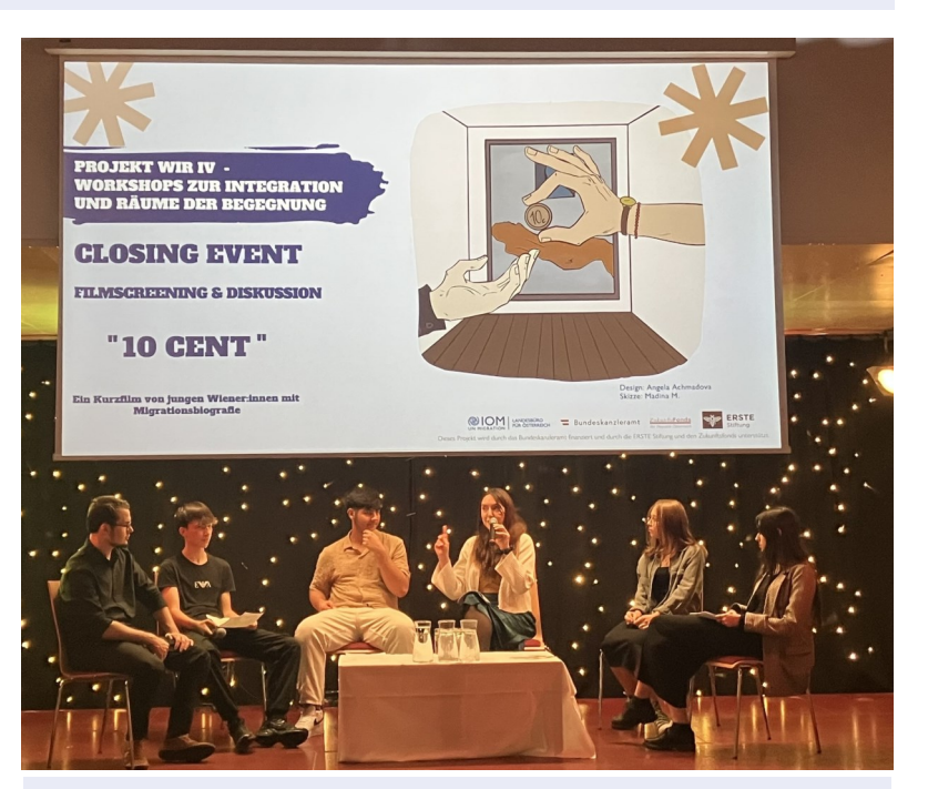
Young participants present their short films at the closing event.

You can find out more about the WIR project on our website and on Instagram.